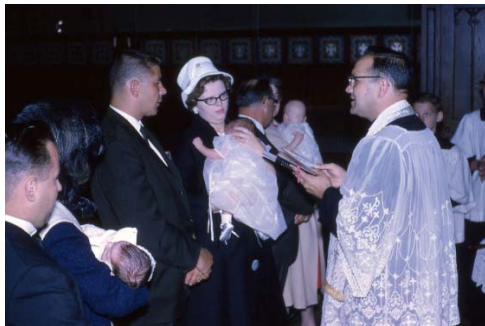
Baptism at Sacred Heart Church, June 13, 1965

Do you have any old photos of your Polish ancestors? The Polish Heritage Library is accepting any photos or memorabilia for their archives depicting the Polish community in Syracuse over the years. We would like to preserve our history by scanning any photos or program books. We will scan and return the originals, or gladly add them to our archives.