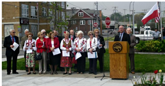
Polish Constitution Day 2012

Sending the newsletter is very costly and is a privilege reserved for current members. If your card does not say "2012" this will be the last newsletter you will receive. Also, if you would prefer not to receive a newsletter in the mail, please drop us a note at syracusepolishhome@yahoo.com or let the bartenders know. The newsletter is always posted to our website, syracusepolishhome.com , and we are looking ahead to being able to deliver it by email to those who would prefer to receive it online. Thank you for supporting your Polish Home.