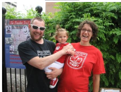
Polish Fest 2012