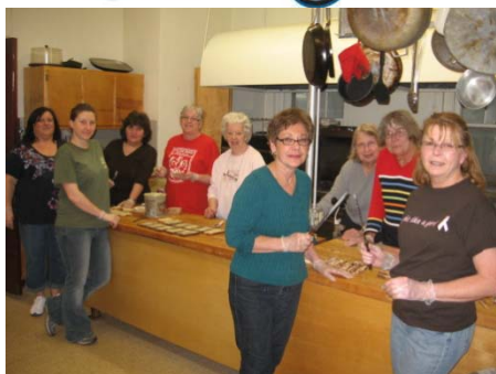
Kitchen Crew for Polish Constitution Day