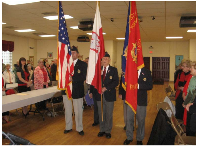
Polish Constitution Day