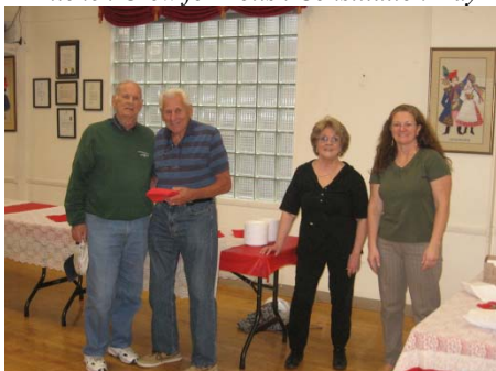
Polish Constitution Day Crew