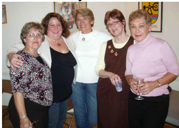
Photos from Membership party a few years back.