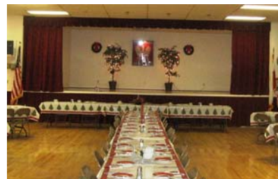
New Stage Curtains