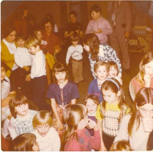
Mug Club Christmas party 1970's

If you have any copies of the old Polonia Gazette or any Polish Newspapers or any photos of life in the Polish neighborhood, please share them with us. We will scan them to preserve them for posterity and return the originals to you if you wish.