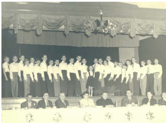
1950's Christmas Pageant at the Polish Home