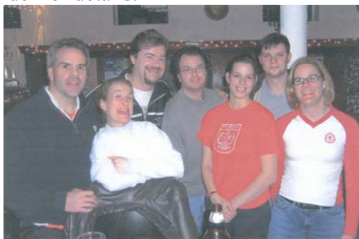
Some of the Polish Home Soccer Team members