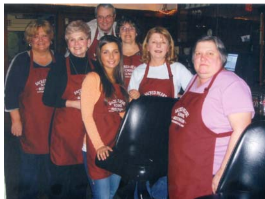
Sacred Heart Reunion Dinner Fundraiser January 2008