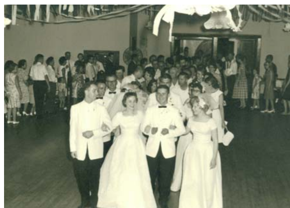
Wedding at Polish Home 1964