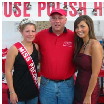
Polish Fest 2008

using our website – www.syracusepolishhome.com