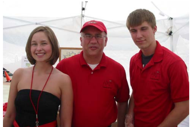
Polish Fest 2008