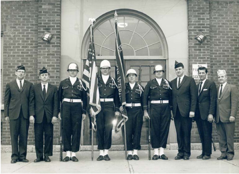
Polish American Veterans, Post 1 Polish Home Website: www.syracusepolishhome.com Halloween candy check