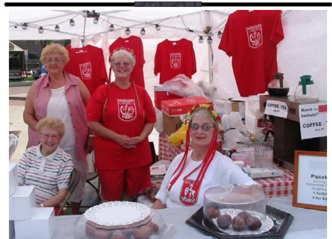
Polish Fest 2005