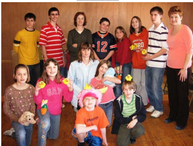
Lasowiaczy Polish Dancers pose at Easter time.