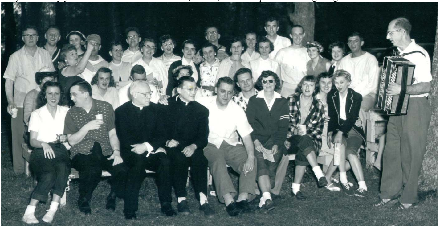
Paderewski Choir Picnic 1953

The I.J. Paderewski Choir of Sacred Heart has had a long-time association with the Polish Home and continues to this day. For many years the choir has held breakfasts, dances, as well as post-rehearsal get-togethers at the Polish Home