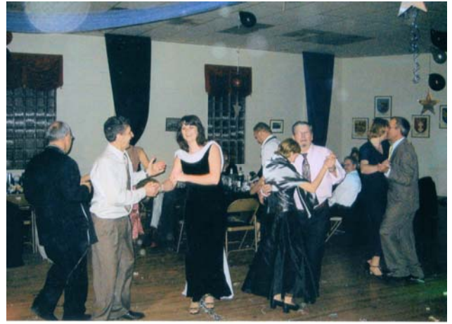
New Year's Eve 2005 at the Polish Home